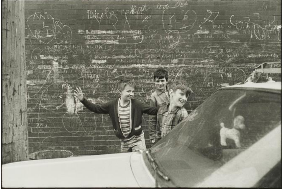
Cartier-Bresson's decisive moment style shows here.